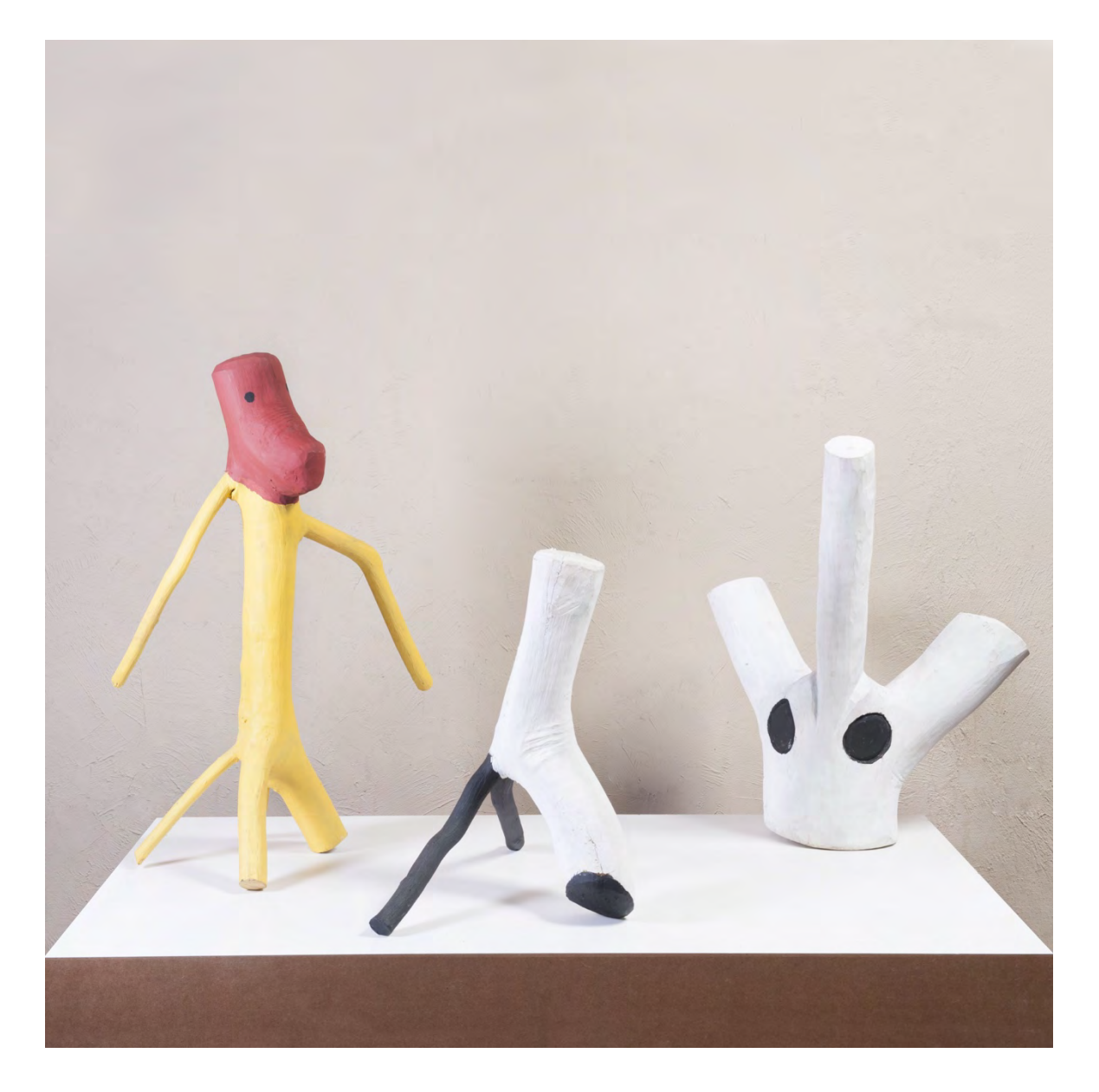
2017 Suddenly into the World, Gustavo Rebello Art, Rio de Janeiro, RJ, Brazil