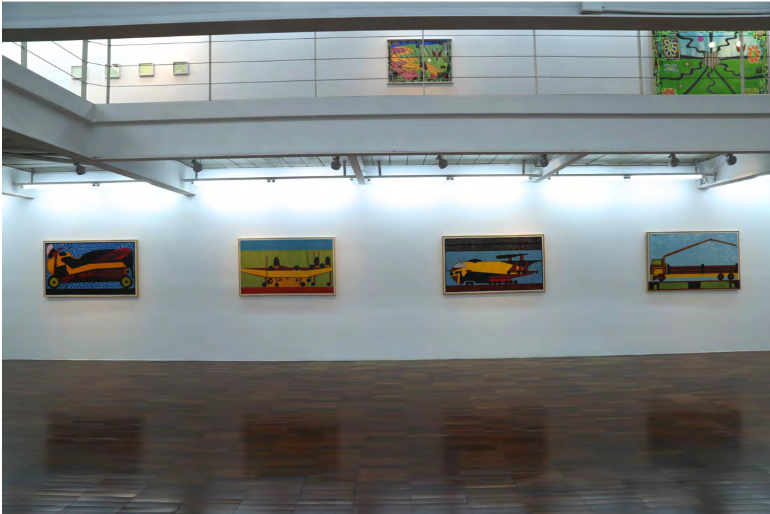
2020 Outsider Art Fair, online, Paris, France