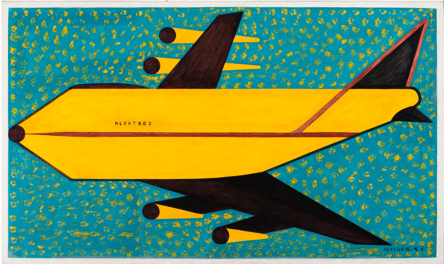
Albatros, 1996 Acrylic on canvas 89 x 150 cm | 35.05 x 59.05 in