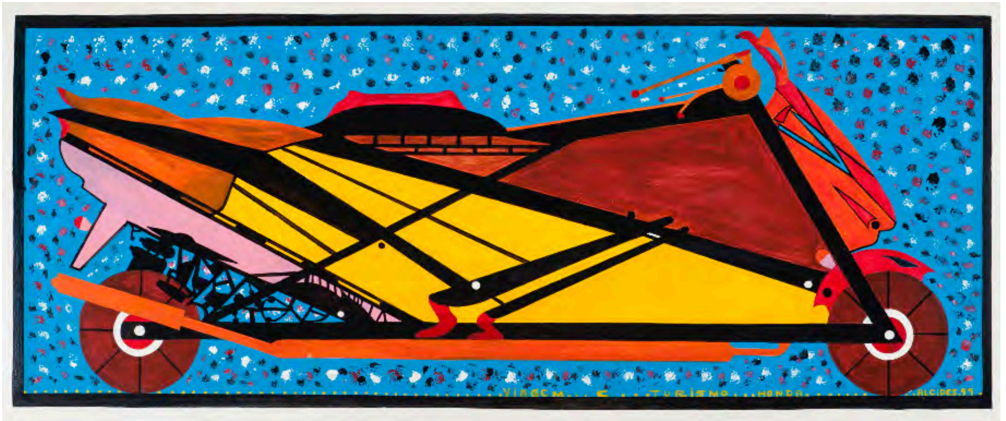
Honda travel and tourism, 1999 Acrylic on canvas 68 x 155 cm | 26.77 x 59.05 in