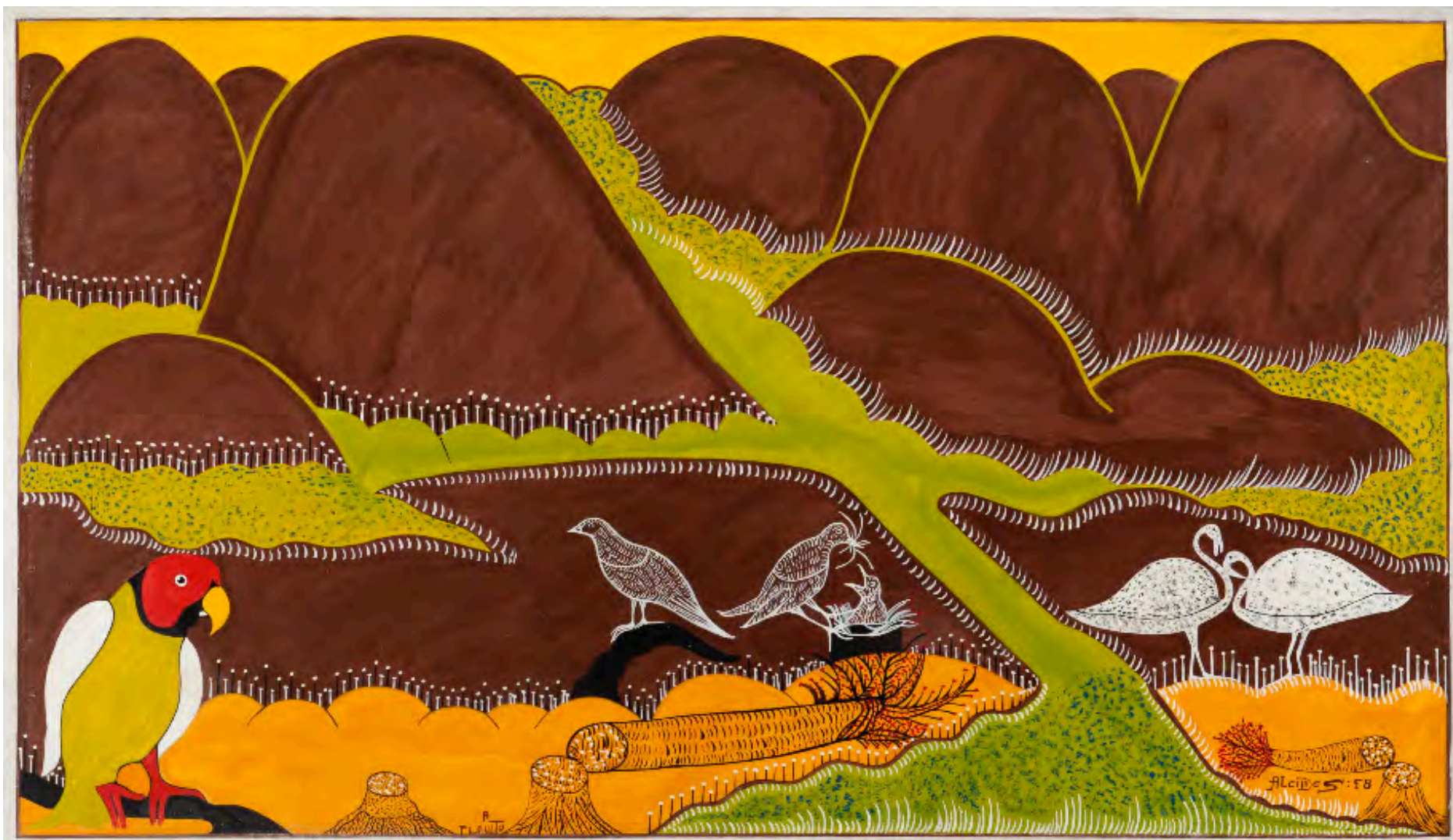
The Plantation, 1998 Acrylic on canvas 88 x 150 cm | 34.64 x 59.05 in