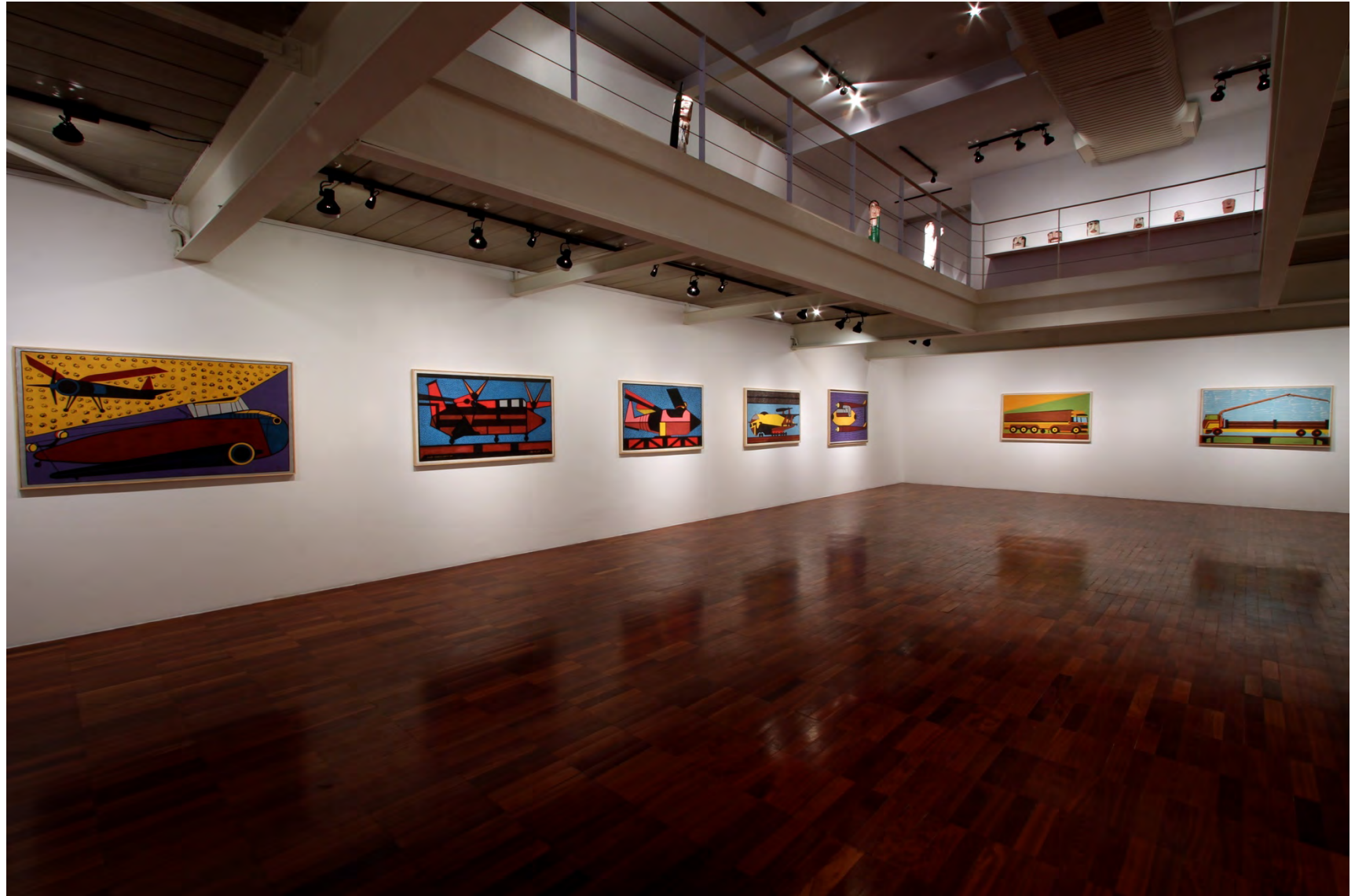
2013 Alcides' poetic machines, Galeria Estação, São Paulo, SP, Brazil