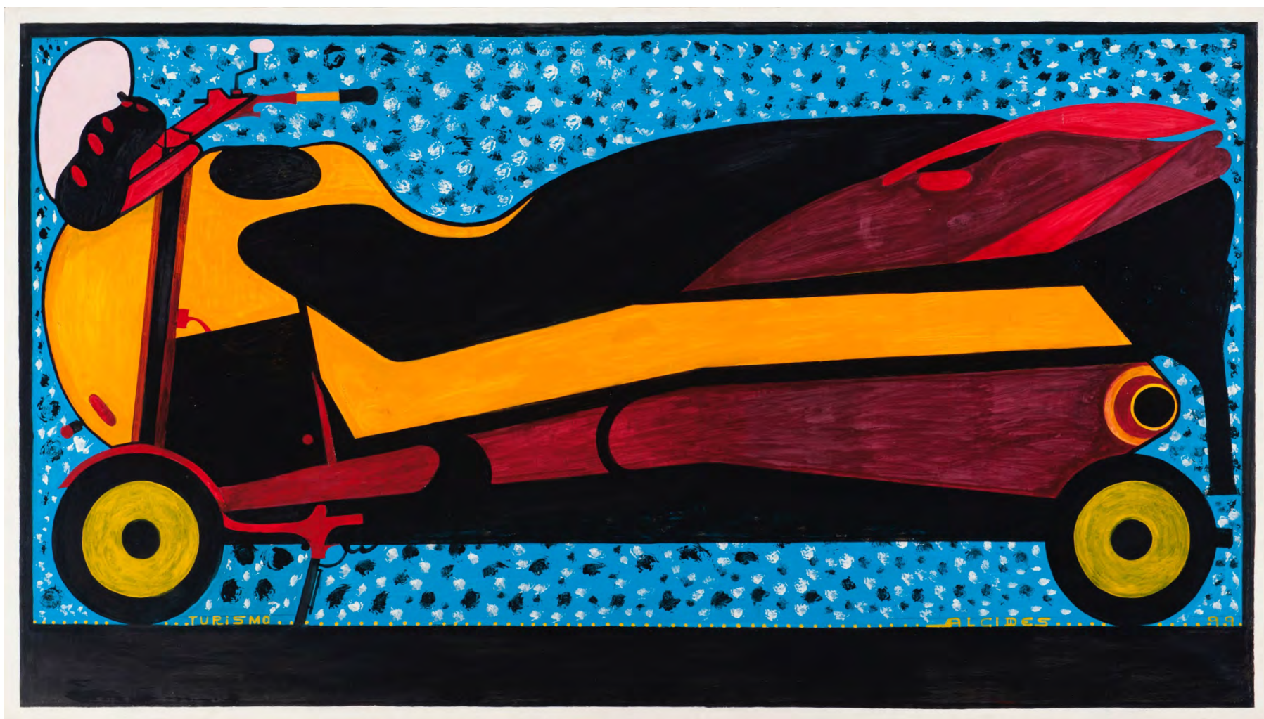
Tourism, 1999 Acrylic on canvas 88 x 155 cm | 34.64 x 61.02 in