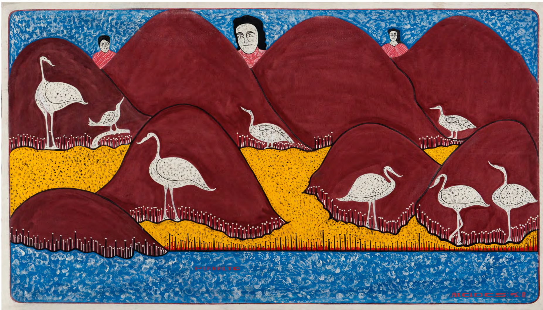
Plateau, 1998 Acrylic on canvas 88 x 155 cm | 34.64 x 61.02 in