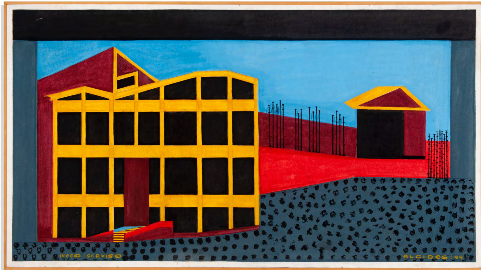
Iveco Serviso, 1995 Acrylic on canvas 87 x 154 cm | 34.25 x 60.62 in