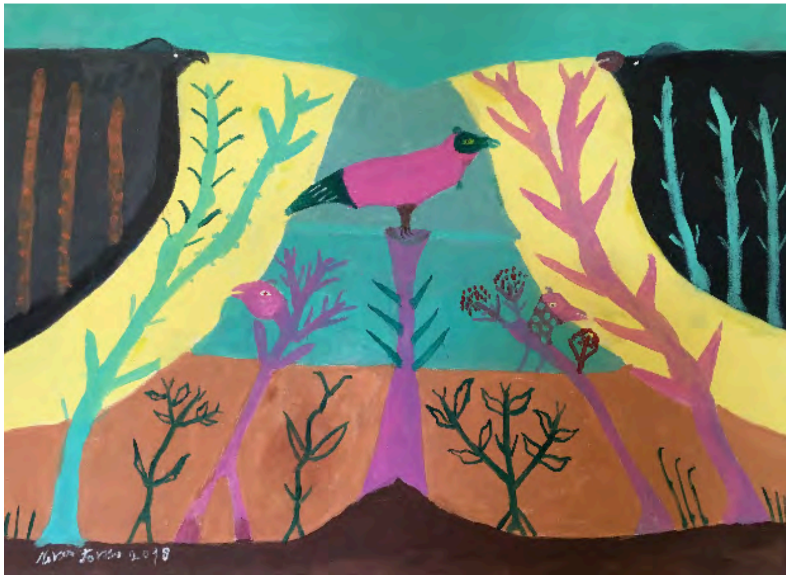
Untitled, 2018 Oil on canvas 50 x 70 cm | 19.68 x 27.55 in