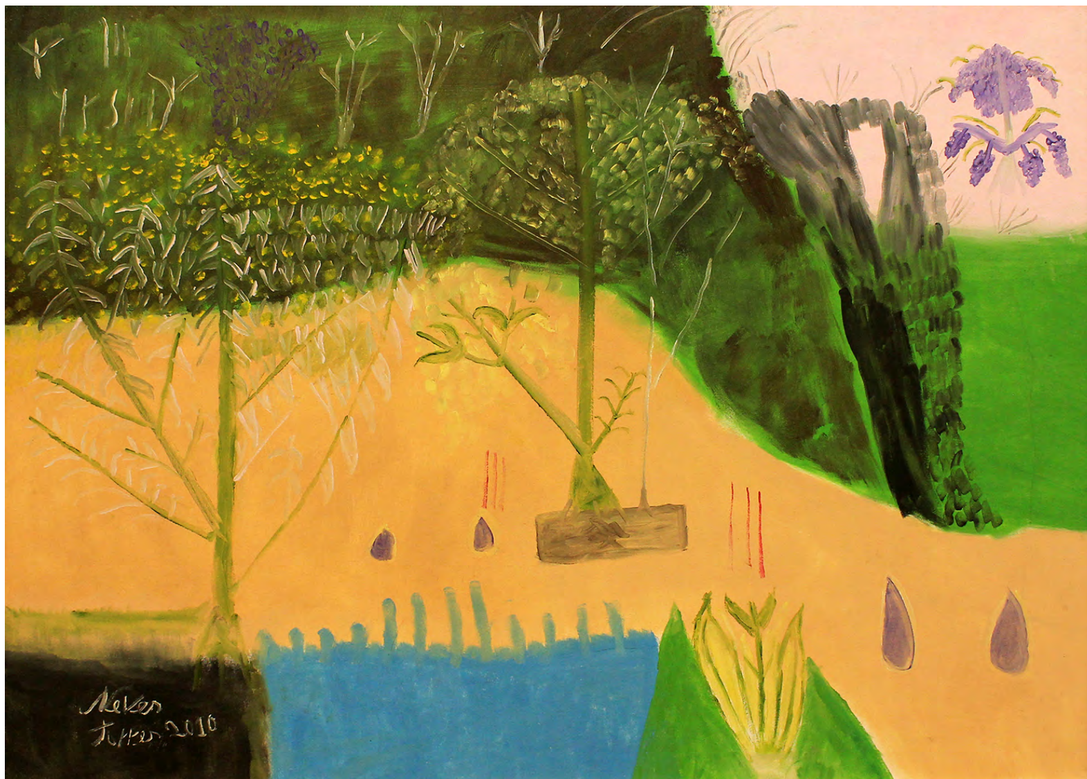
Untitled, 2011 Oil on canvas 50 x 70 cm | 19.68 x 27.55 in