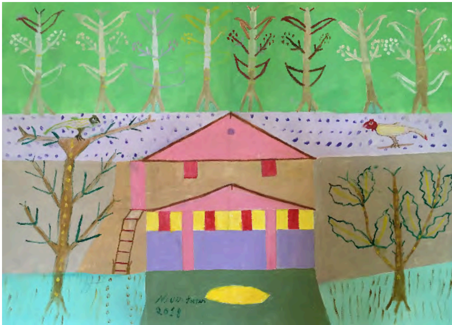
Untitled, 2018 Oil on canvas 50 x 70 cm | 19.68 x 27.55 in