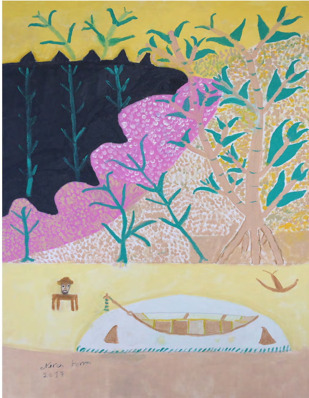
Untitled, 2017 Oil on canvas 70 x 50 cm | 27.55 x 19.68 in