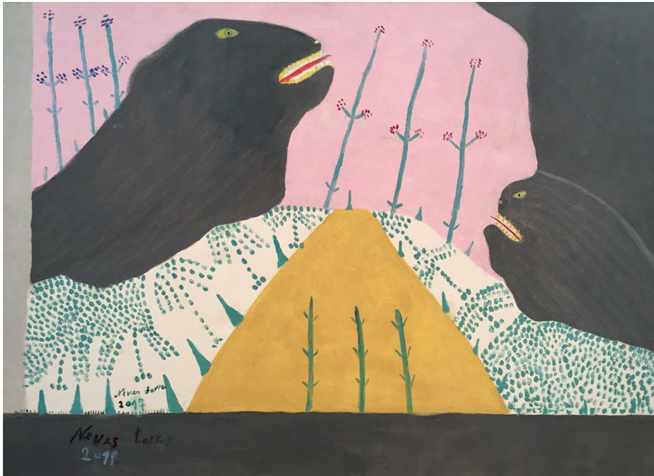
Untitled, 2019 Oil on canvas 50 x 70 cm | 19.68 x 27.55 in