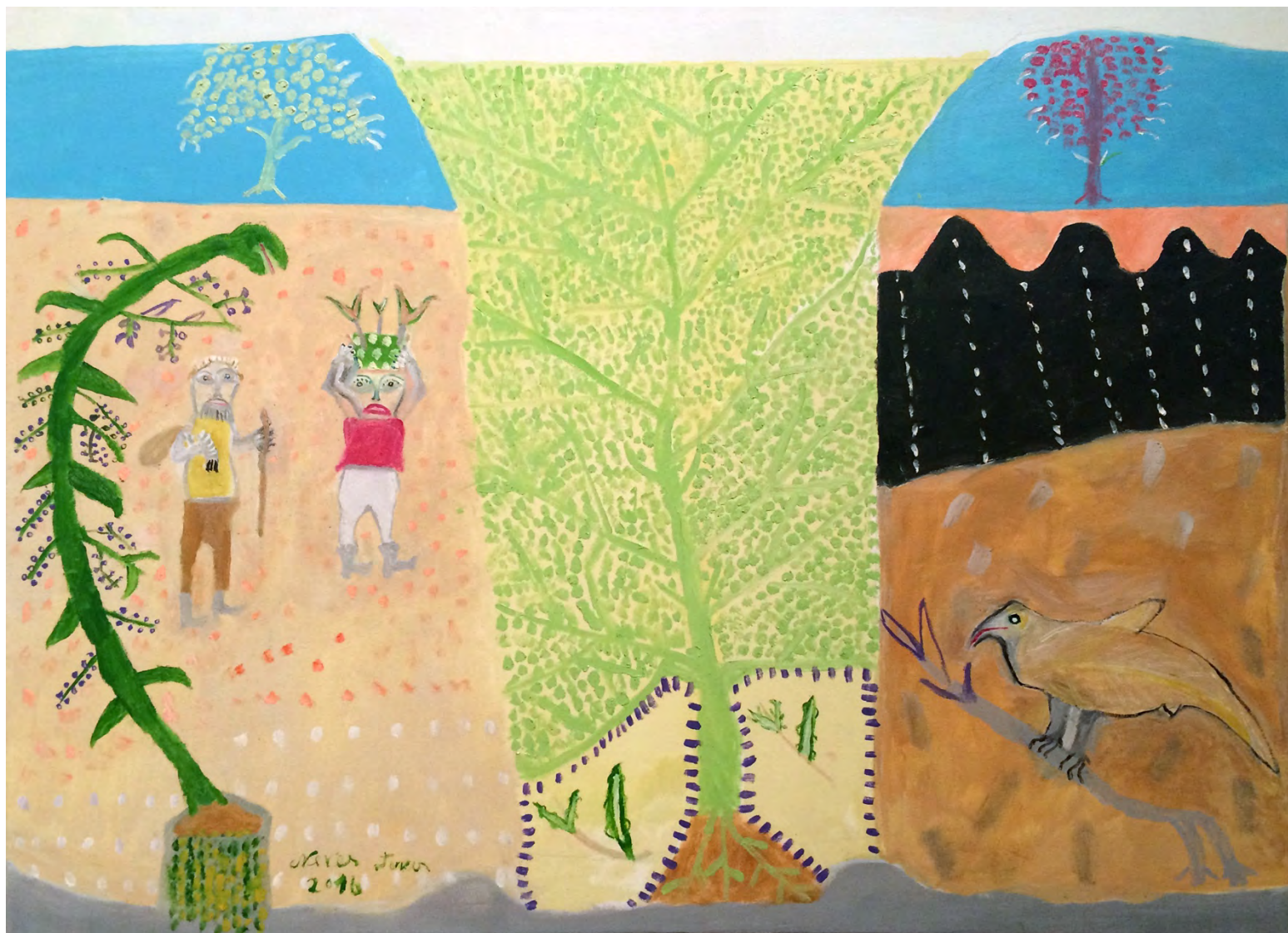
Untitled, 2016 Oil on canvas 50 x 70 cm | 19.68 x 27.55 in