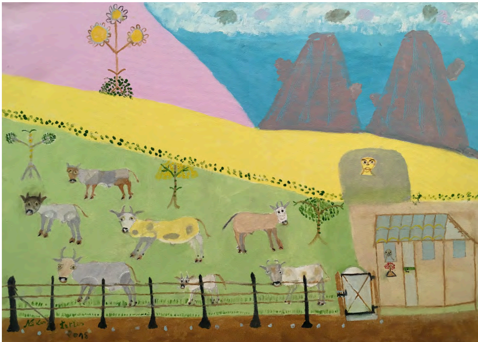
Untitled, 2017 Oil on canvas 50 x 70 cm | 19.68 x 27.55 in