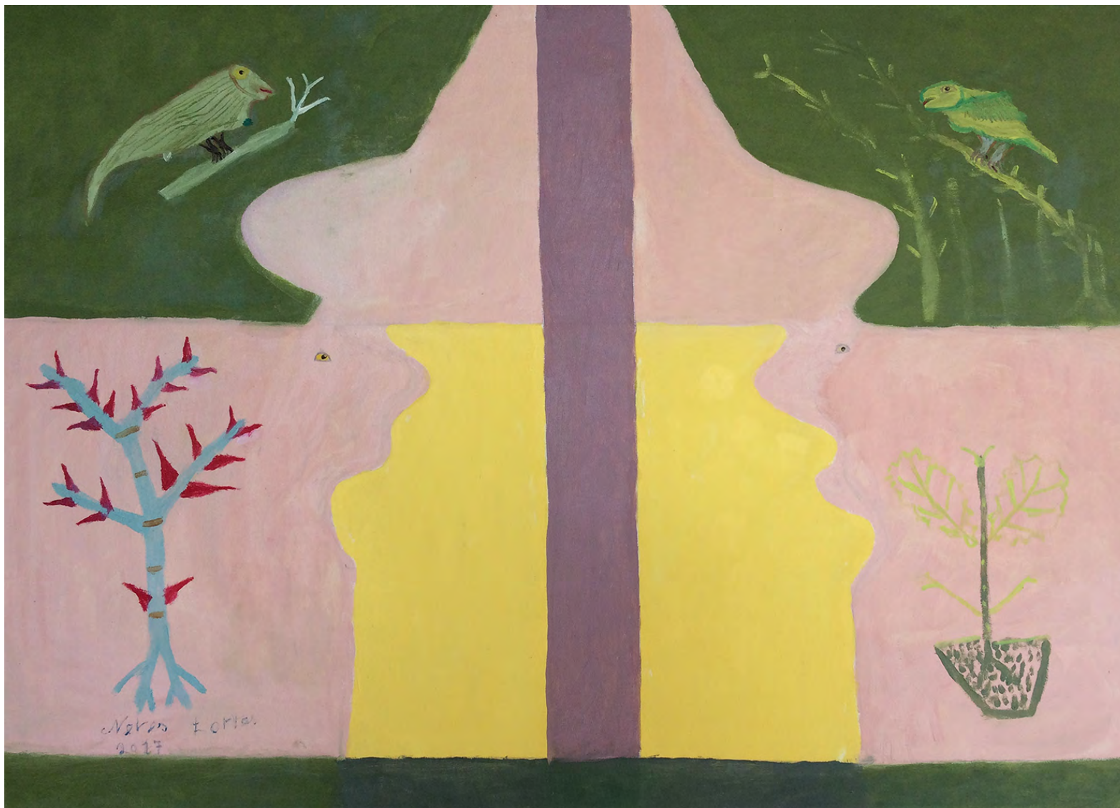
Untitled, 2017 Oil on canvas 50 x 70 cm | 19.68 x 27.55 in