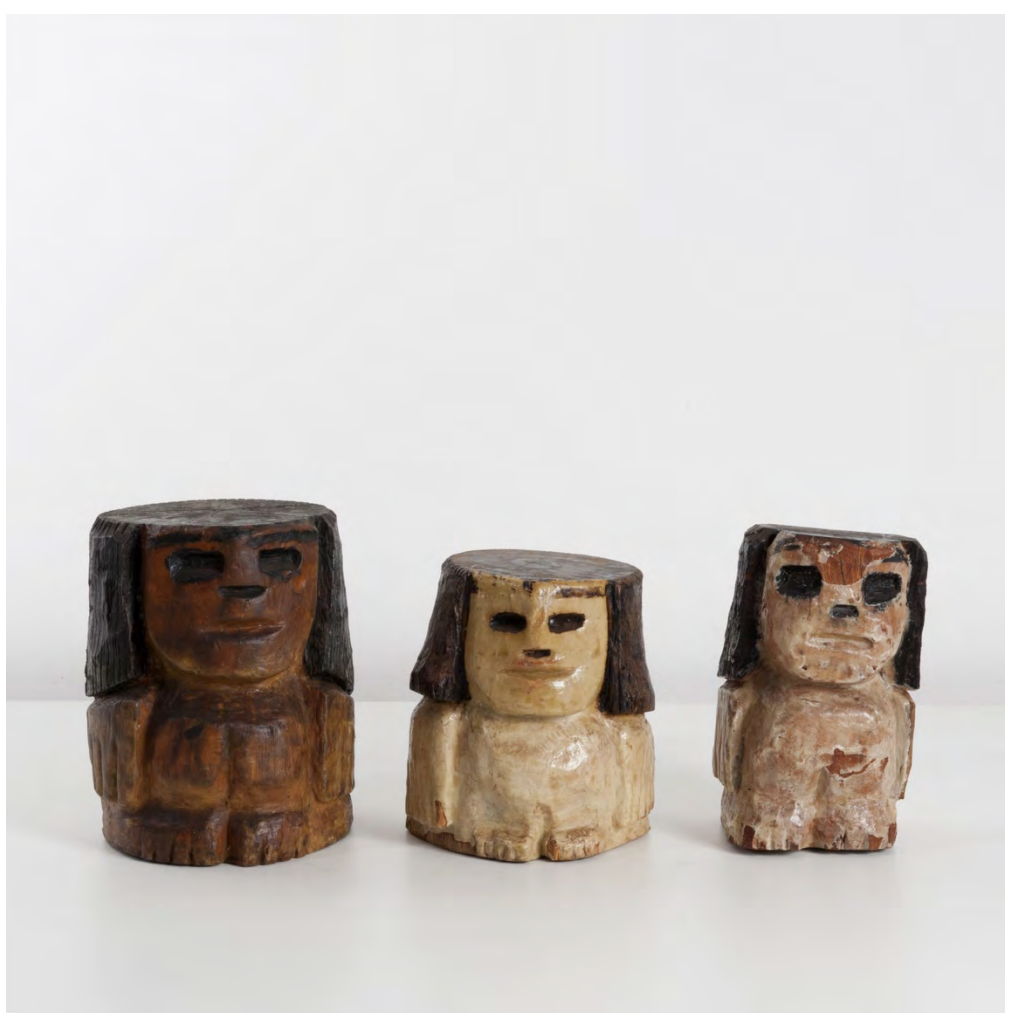
2017 Conceição dos Bugres, Galeria Estação, São Paulo