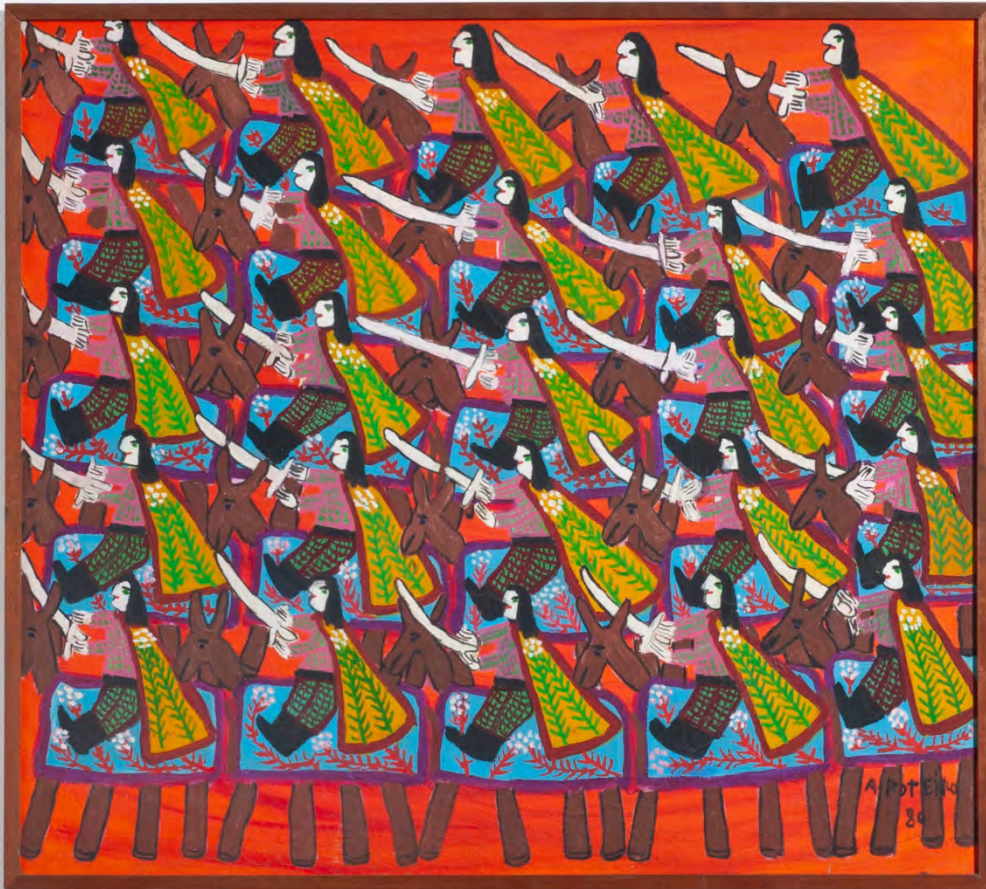
Untitled, 1980 Oil on canvas 75 x 85 cm | 29.52 x 33.46 in