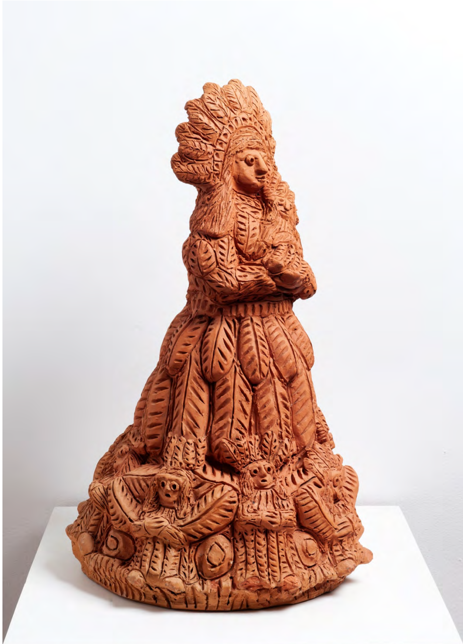
Untitled, Ceramic 71 x 42 x 42 cm | 27.95 x 16.53 x 16.53 in