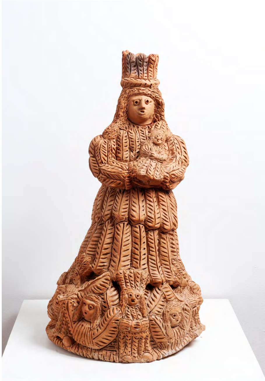
Untitled, Ceramic 78 x 36 x 36 cm | 30.70 x 14.17 x 14.17 in