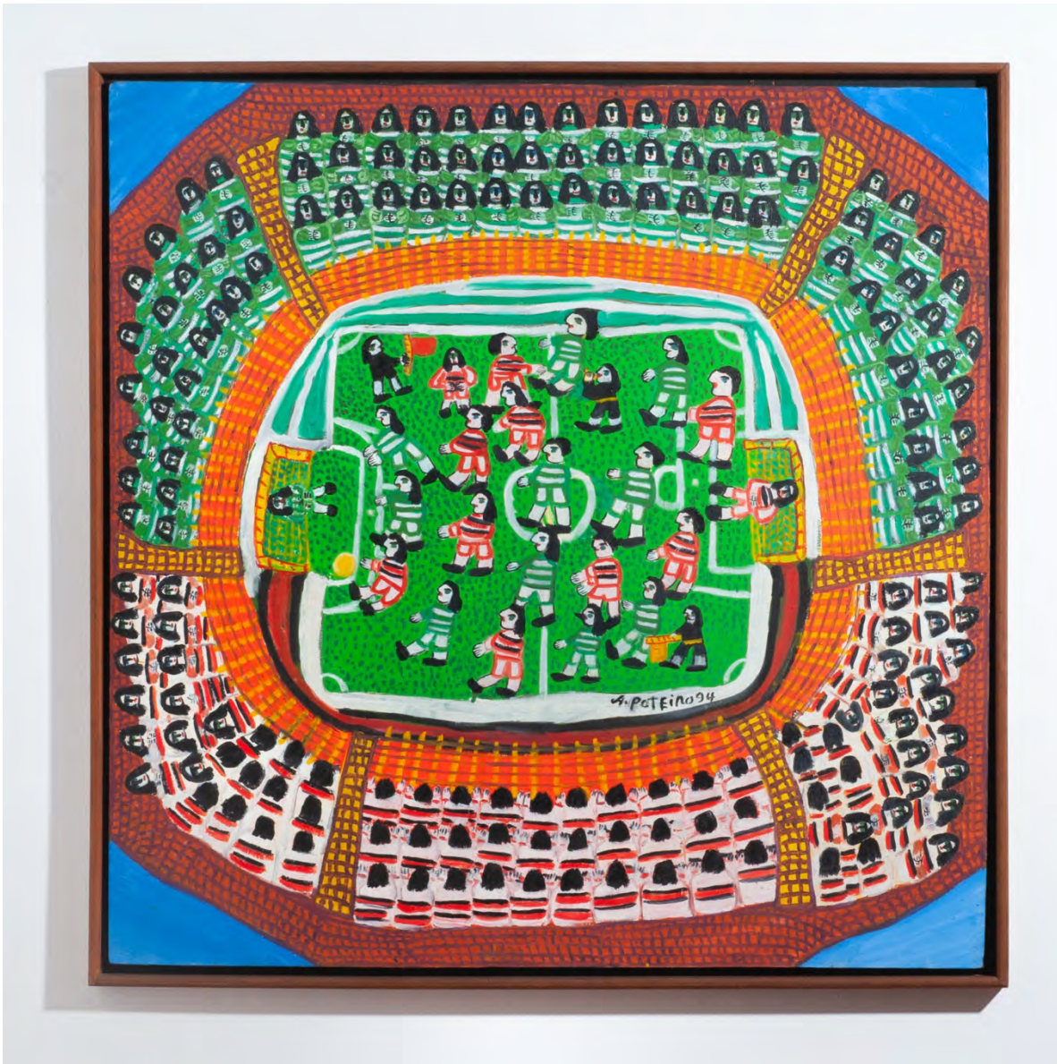
Untitled, 1994 Oil on canvas 120 x 120 cm | 47.24 x 47.24 in