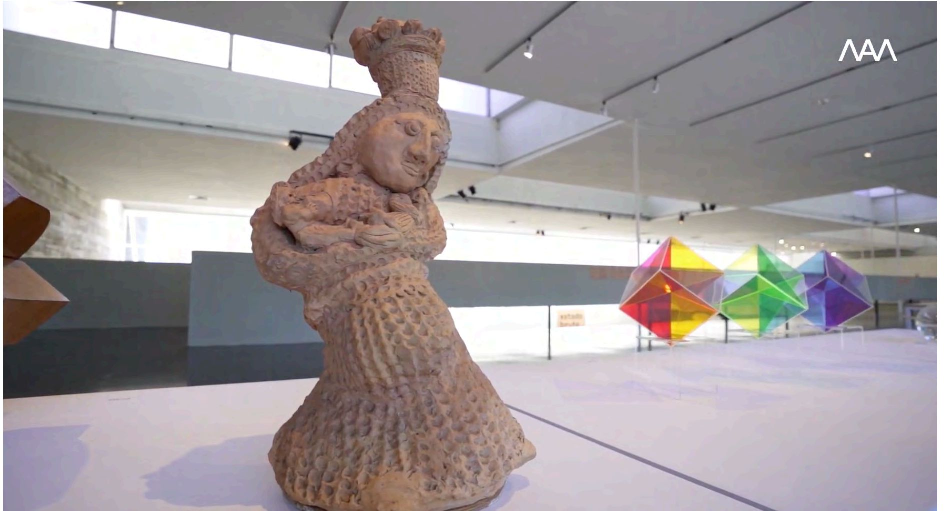
Photo of MAM-Rio

2021 Raw State, Museu de Arte Moderna do Rio de Janeiro, Rio de Janeiro