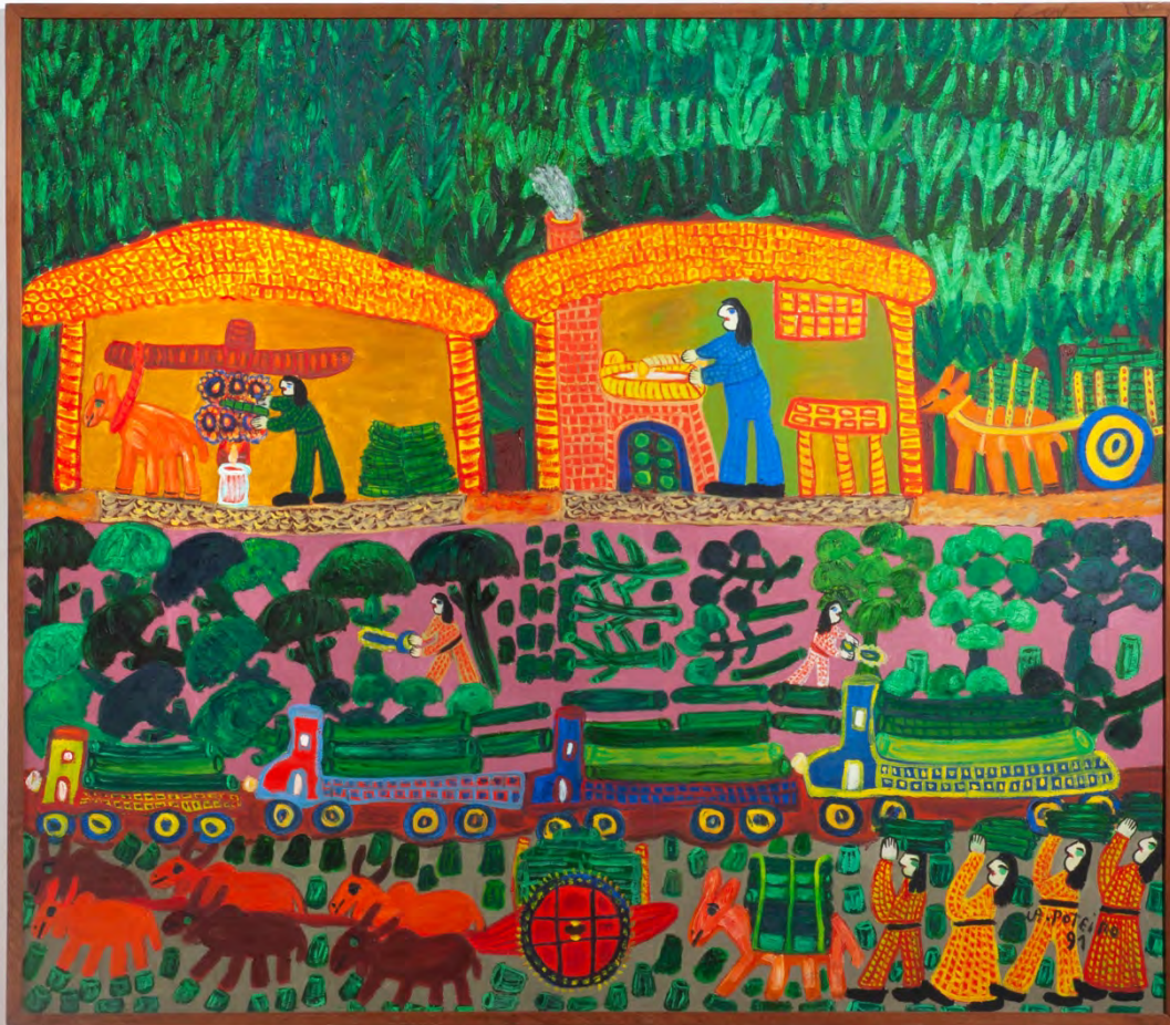
Untitled, 1991 Oil on canvas 150 x 130 cm | 59.05 x 51.18 in