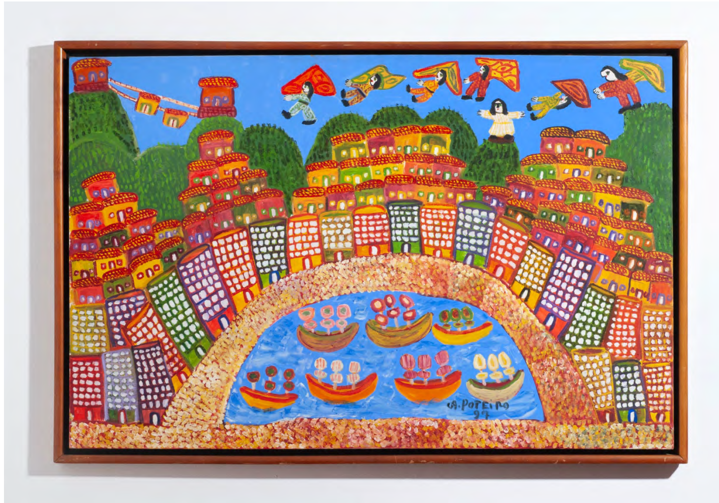
Rio de Janeiro, 1997 Oil on canvas 90 x 140 cm | 35.43 x 55.11 in