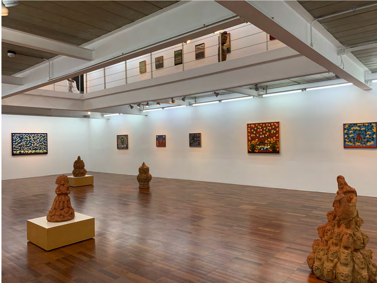
2020 Poteiro - A tribute, Galeria Estação, São Paulo, SP, Brazil