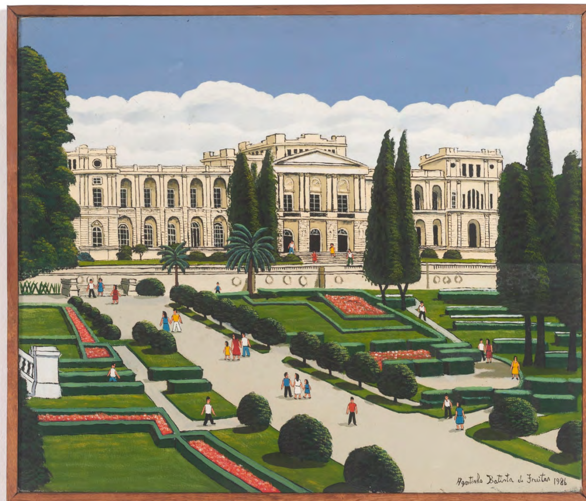
Parque do Ipiranga, 1986 Oil on canvas 53 x 63 cm | 20.87 x 24.8 in