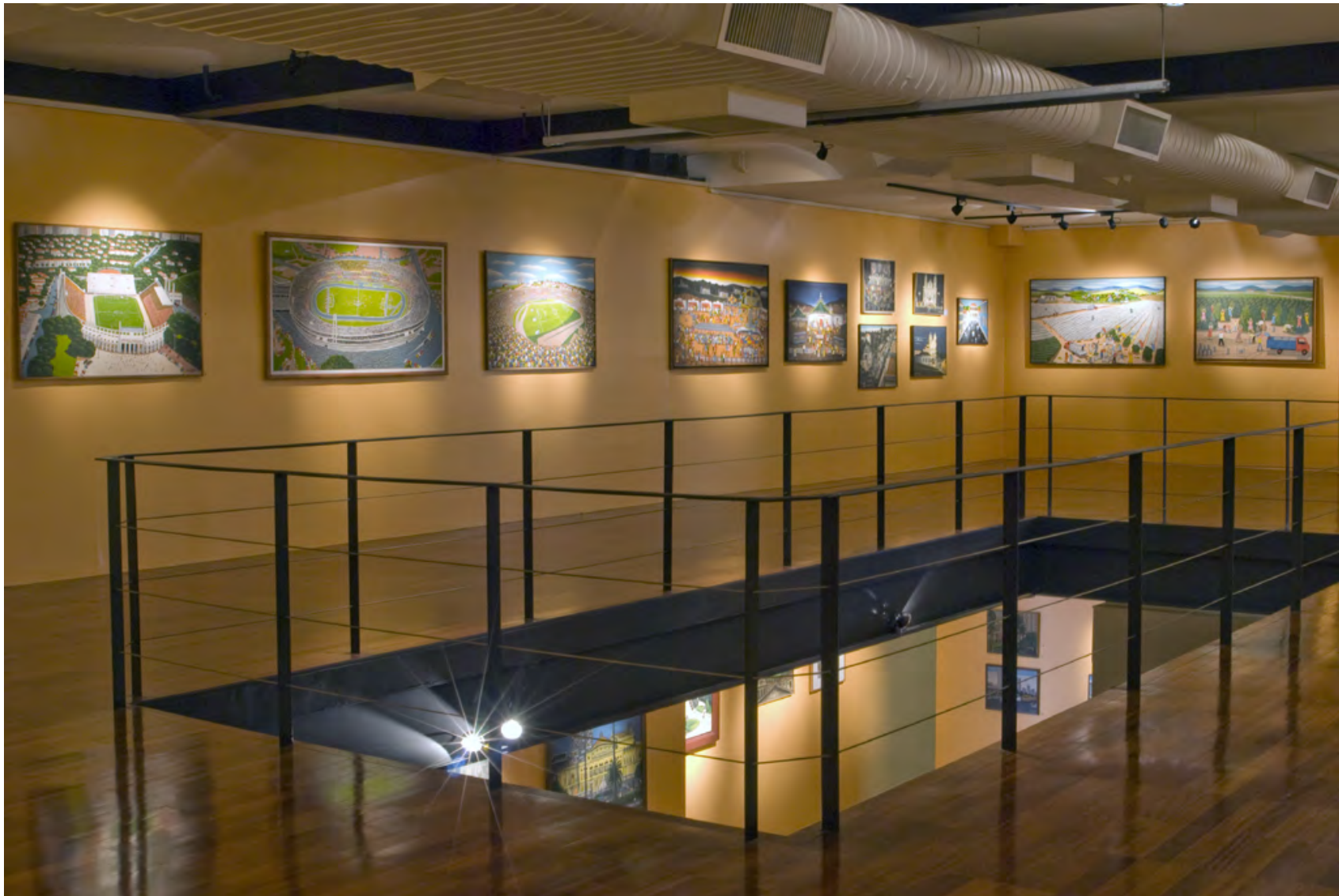
2008 Right to Poetry, Galeria Estação, São Paulo, SP, Brazil