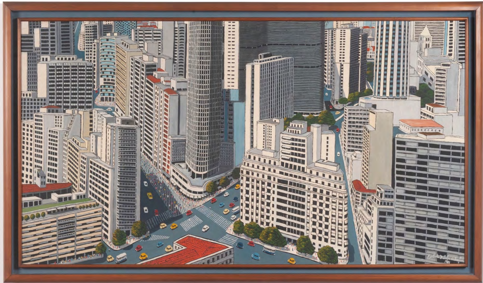
Avenida Ipiranga x São Luis, 1983 Oil on canvas 80 x 140 cm | 31.49 x 55.12 in