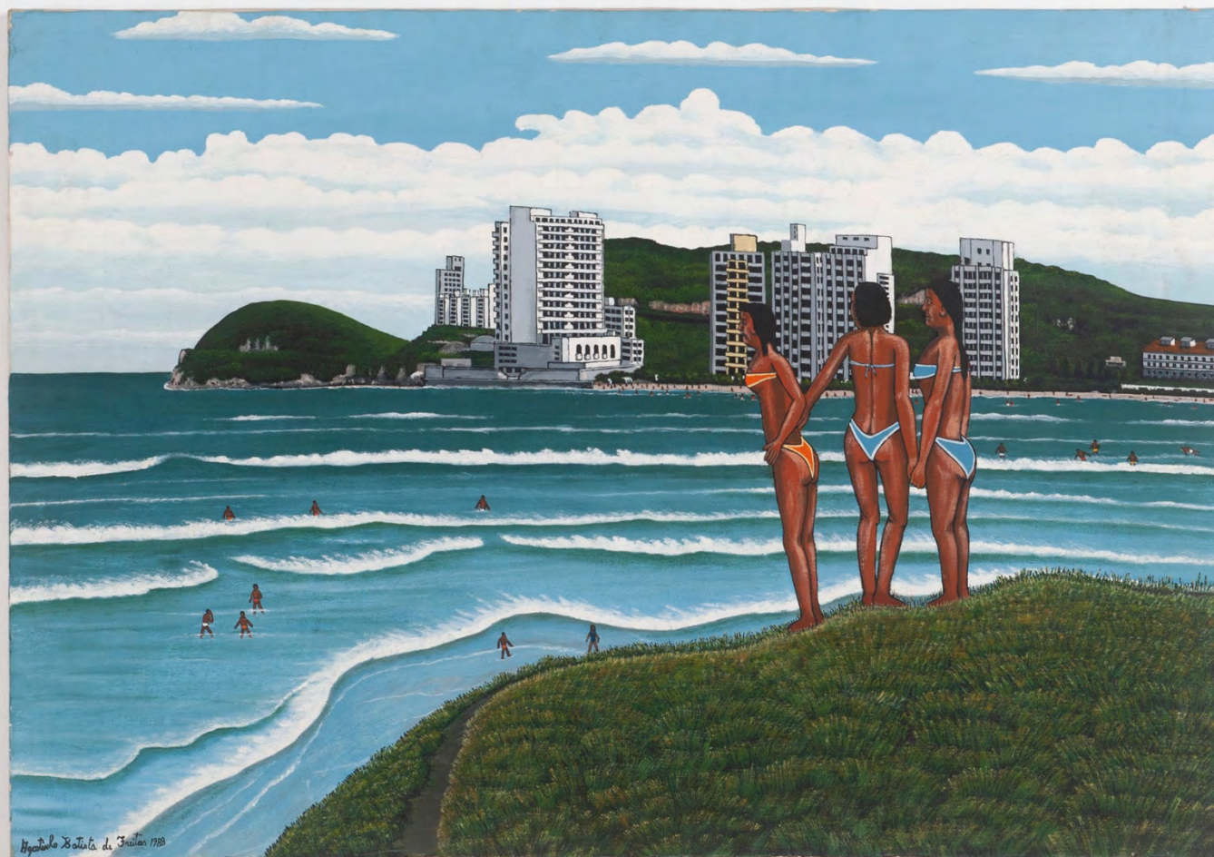
Praia das astúrias, 1988 Oil on canvas 70 x 100 cm | 27.55 x 39.37 in