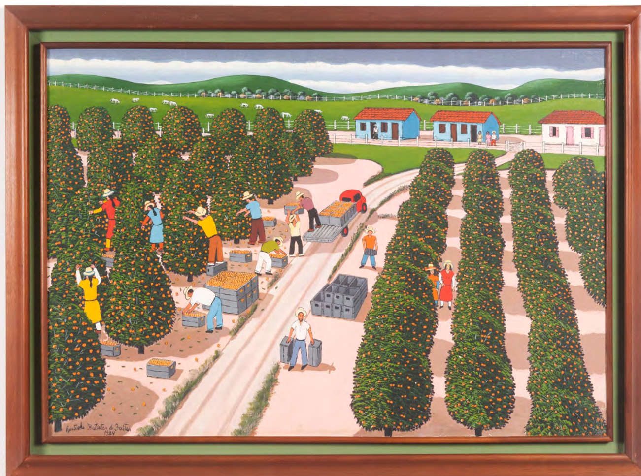
Untitled, 1984 Oil on canvas 70 x 100 cm | 27.56 x 39.37 in