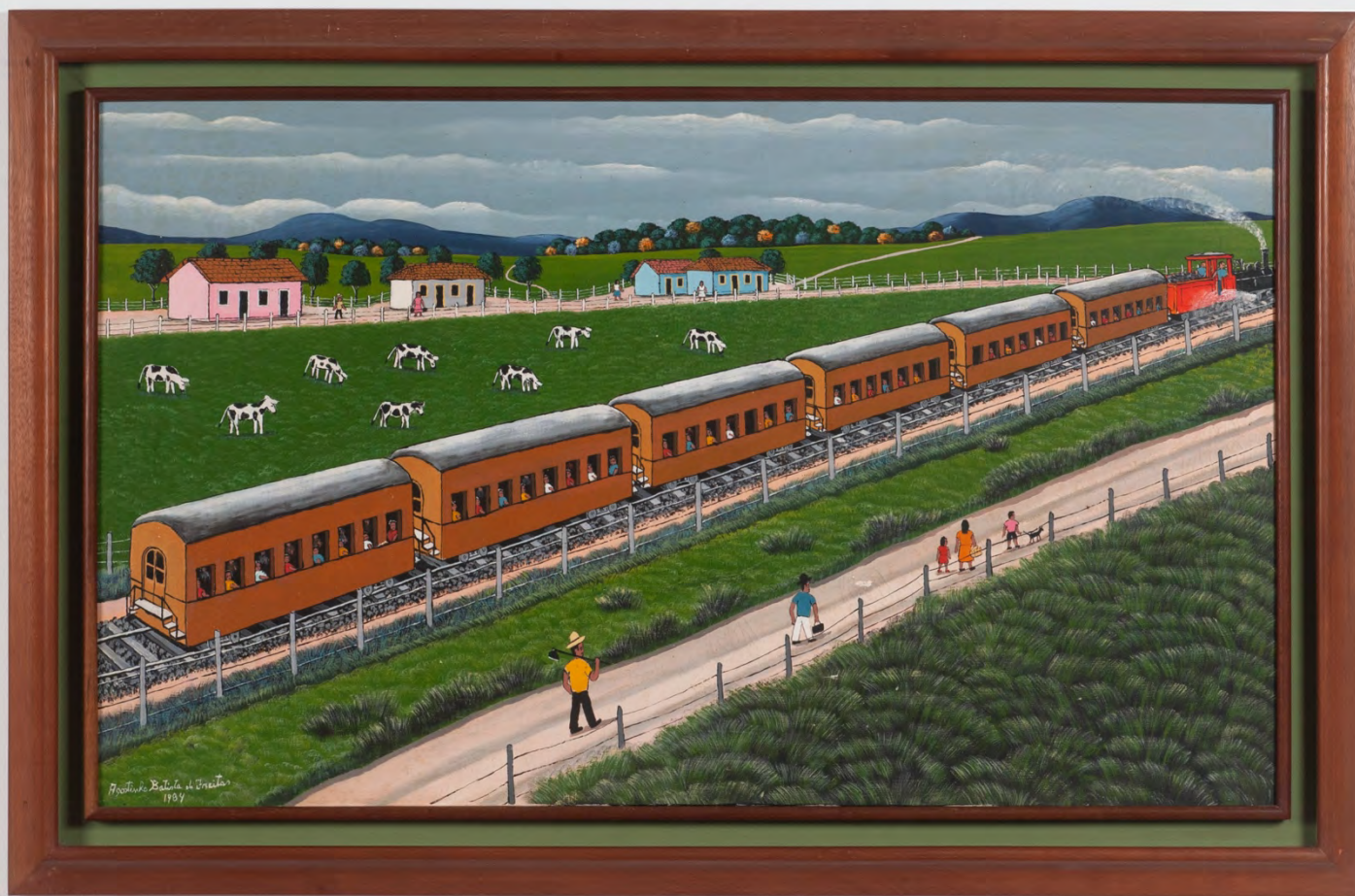
Untitled, 1984 Oil on canvas 60 x 100 cm | 23.62 x 39.37 in