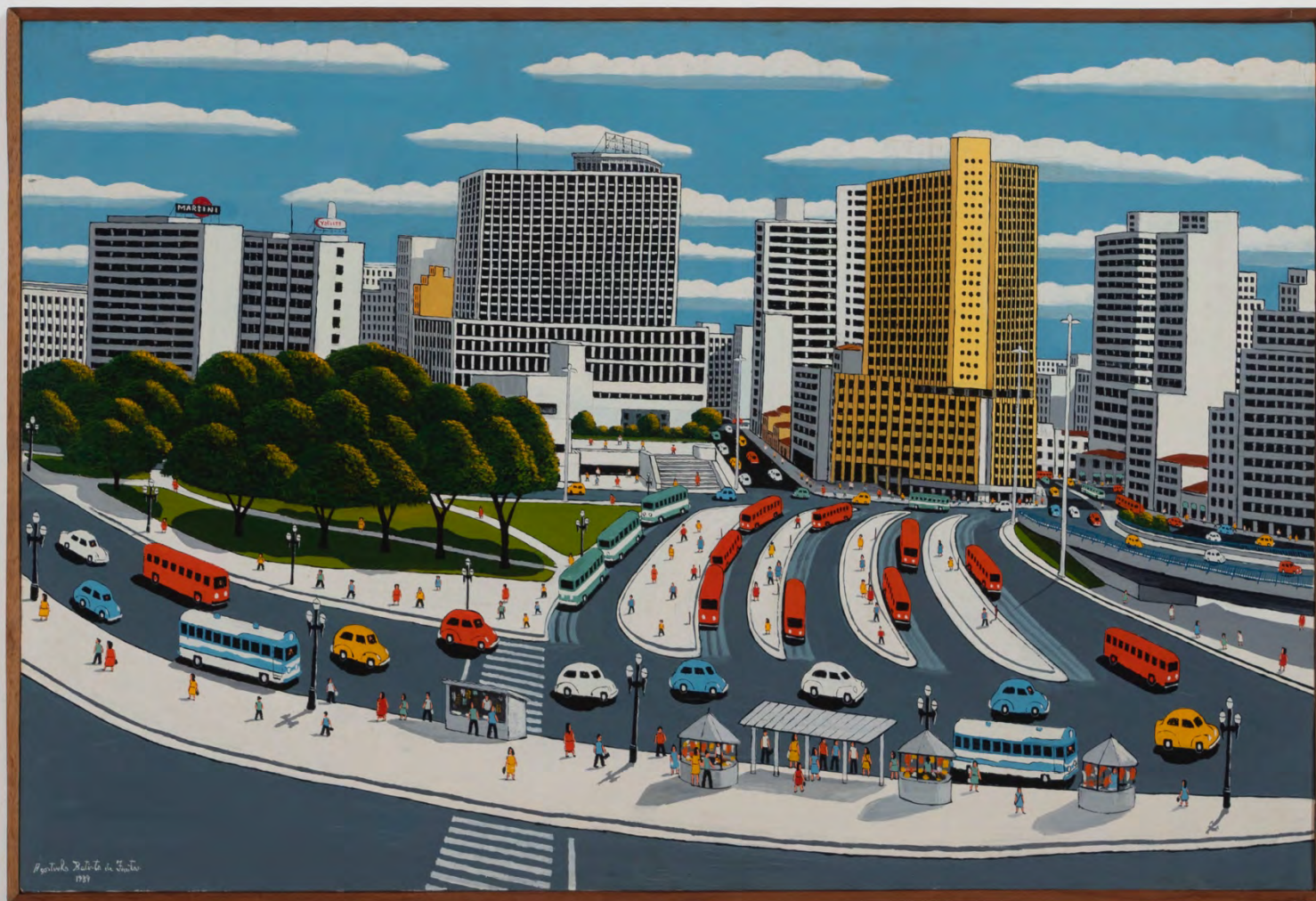
Praça da Bandeira, 1989 Oil on canvas 80 x 120 cm | 31.5 x 47.24 in